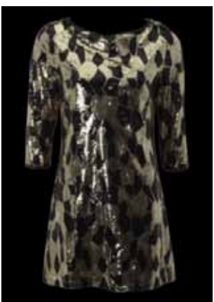
Matalan long sleeve sequined dress £28

Remember most larger New Look stores stock shoes up to 9 wide fitting!!