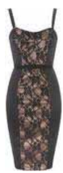
Asda lace panel dress £20

If you fancy something new, here are my suggestions for that special party dress that won't cost you an arm and a leg.