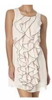
BARGAIN New look ruffle front dress £15