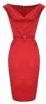
Asda Red Satin Pencil Dress £20

Worried about shoulders and arms? Why not team up with a black wrap or jacket?