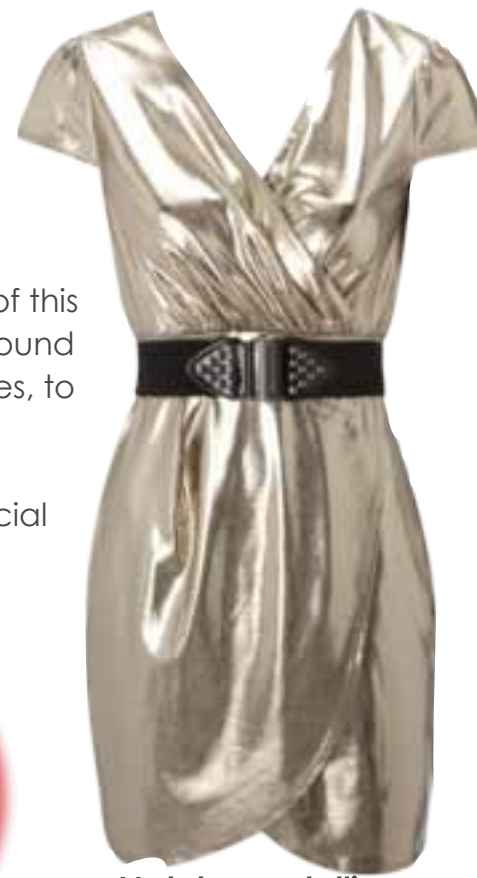
Matalan metallic wrap dress £22

Worried about shoulders and arms? Why not team up with a black wrap or jacket?