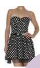
New look spotty party dress £30

Remember most larger New Look stores stock shoes up to 9 wide fitting!!